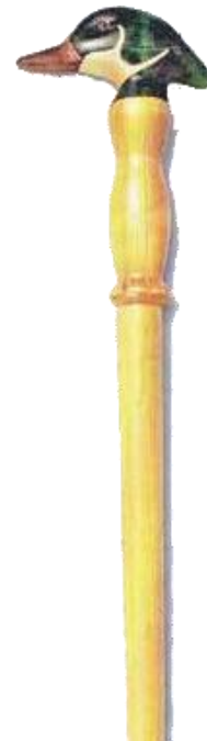
WALKING STICK HANDLES

This requirement must be reviewed with your merit badge counselor.