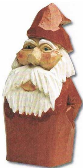
SANTA CLAUS FIGURE