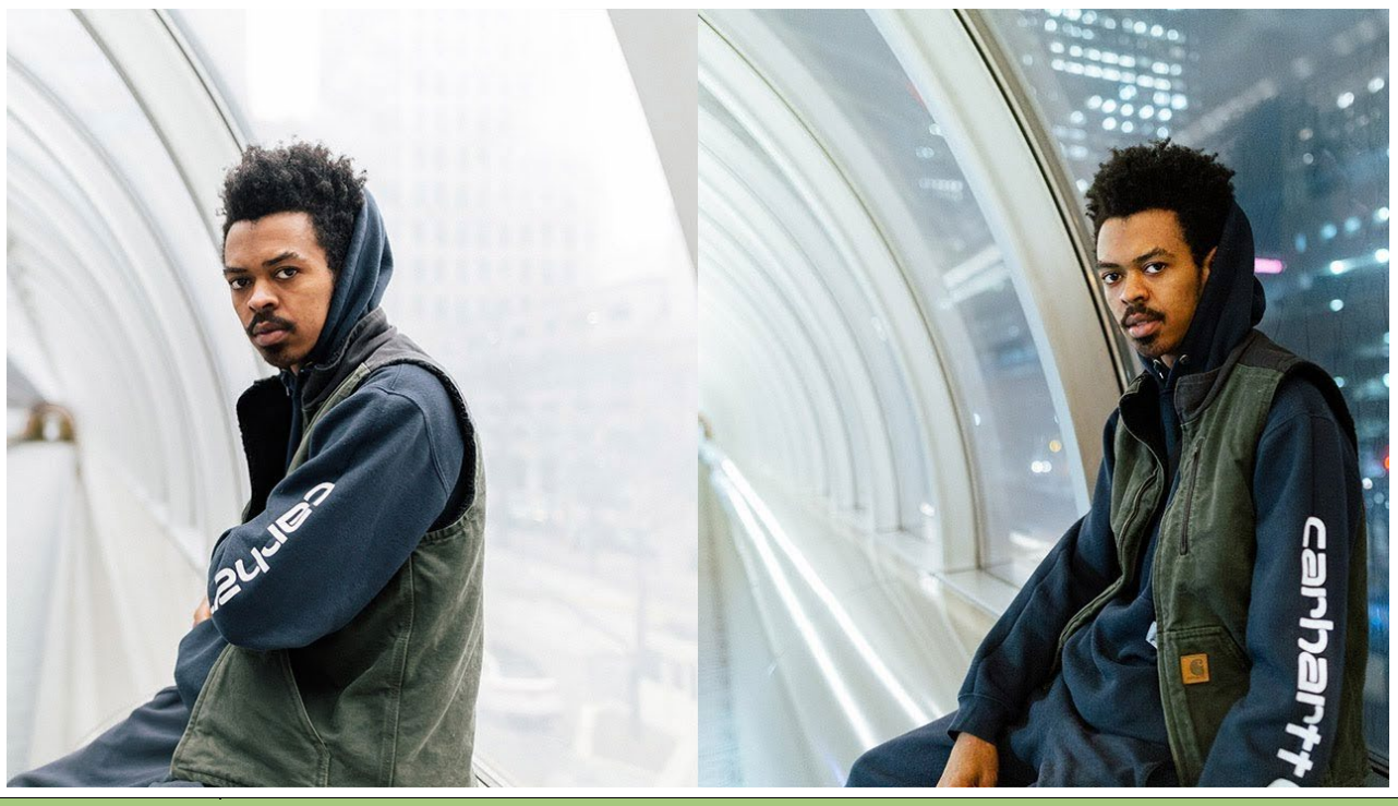
REQUIREMENT 4c: Photograph one subject with two different depth of fields.

REQUIREMENT 4b: Photograph one subject from two different light sources-artificial and natural.